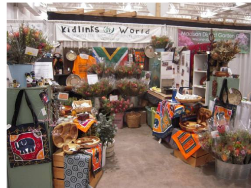
Kidlinks booth at the 2009 Garden Expo