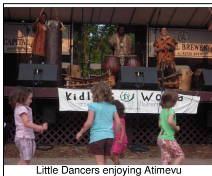
Little Dancers enjoying Atimevu

Kidlinks World, Inc. is very proud to be hosting the 5 th annual Africa Alive, which will be held at Capital Brewery in Middleton. Africa Alive provides entertainment and fun for the